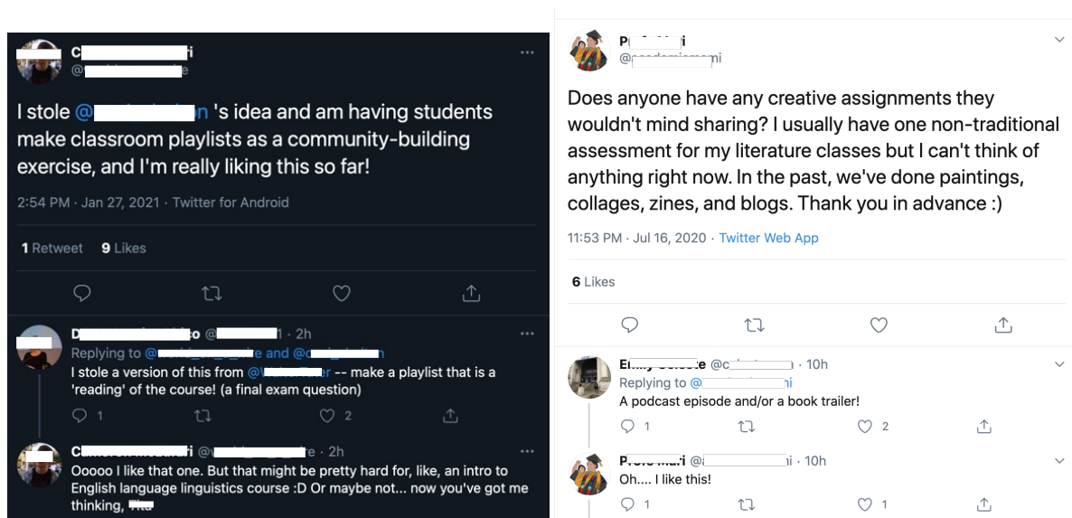
Figure 1. Social media posts of fetishized assignments

Media are epistemological and ontological, bound up in the construction of our knowledge and selves. Meaning-making occurs through and within technical tools as technical objects, tools that are not neutral but rather authorial participants in meaning-making. Composing tools can be said to be co-authors due to the ways they shape the human writer's experience of reality and influence thinking. Consider, for instance, what happens when different composing tools are used in order to tackle a writing task from a different perspective. Think of times when you've printed a draft to highlight, draw on, and cut up, or left the linearity of the word processor for other digital applications like Scrivener or OneNote that allow authors to tag and rearrange content. These tool changes lead to changes of experience and perspective that modify authorial thinking and, therefore, shape content. The fetishization of digital tools as simple and neutral obscures their co-authorship roles and limits acknowledgement of the extent to which writing is "more-than-human" (Wargo, 2018, p. 4). A more-than-human perspective insists that "technology, environs, and human beings can no longer be conveniently or neatly distinguished" (Brooke & Rickert, 2011, p. 169).